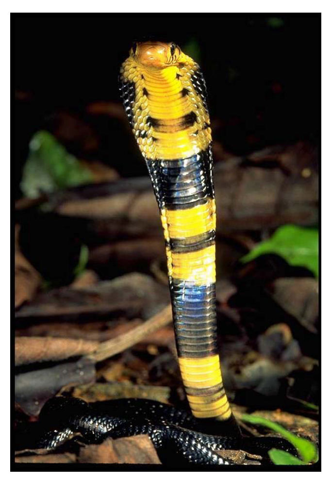
Figure 2 Naja melanoleuca.

education. The information in table 1 is for the total 212 respondents interviewed. In general the more educated respondents had less knowledge on these remedies.