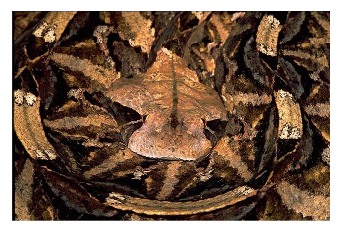
Figure 3 Bitis gabonica.

Snakes are called 'nzoka' and 'thuol' in the Kamba and Luo language respectively. In Kambaland, a number of venomous species were identified: "nzoka ya kiko" or Naja melanoleuca (Fig. 2); the very fierce "yaitha" or Dendroaspis polylepis and 'kimbuva'" or Bitis spp. (Fig. 3) the puff adders. With exception of the spitting cobra, these snakes typically deliver venom through two hollow teeth called fangs; the venom is called 'kiri' in Dholuo and "sumu" in Kikamba. Spitting cobras are notable for visiting settled areas and are reputed to spit venom toward enemies up to 2.5 m away. There was concurrence among the informants that some snake bite cases were caused by malevolent persons.