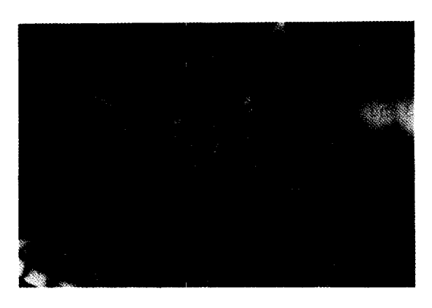
Fig. 2. Vepris lanceolata (Rutaceae).

Some of the plants (Table 2) have been tested for